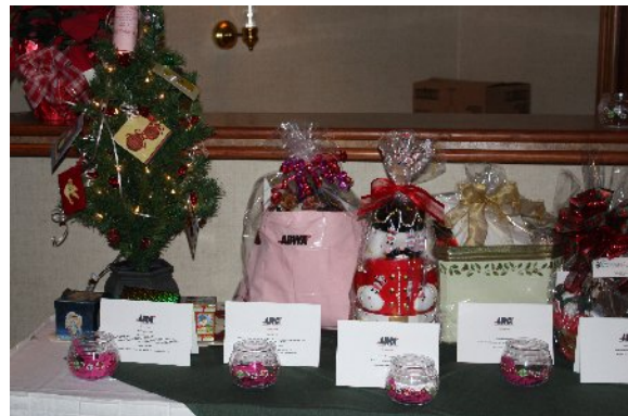
Gift Basket Raffle

"An investment in knowledge pays the best interest."