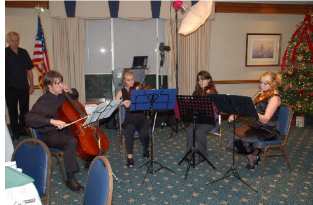
Holiday Gala String Quartet